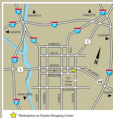
★ Marketplace on Harden Shopping Center

Retail Space Fully Leased Office Space 1,200 - 6,000 SF