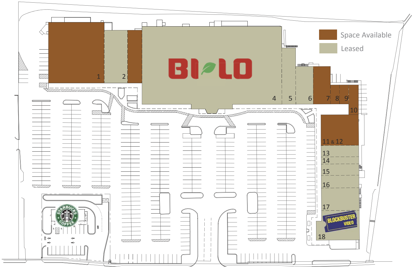
East North Street Extension